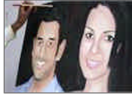
A portrait of Indian captain M S Dhoni and his wife Sakshi Rawat