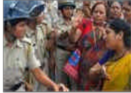
Activists argue with police at a rally during the Bandh in Nagpur