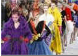
Models walk on ramp for a British designer at Paris fashion show