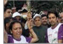
Himachal Pradesh CM holds Queen's Baton at its relay in Shimla